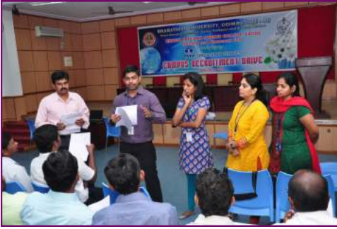
Campus Drive - WIPRO