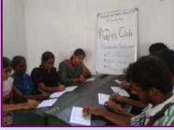
Enrollment of members