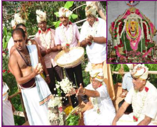
Valampuri Vinayagar Temple Kumbabishekam on 25.06.2013 in our college premises.

Kongu Arts and Science College is a leading co-educational institution in Erode, offering a variety of programmes in Arts and Science streams. It is affiliated to Bharathiar University and run by The Kongu Vellalar Institute of Technology Trust, Perundurai.