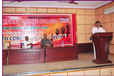
Campus to Corporate(C 2 C) Placement Training Programme on 30.08.2013