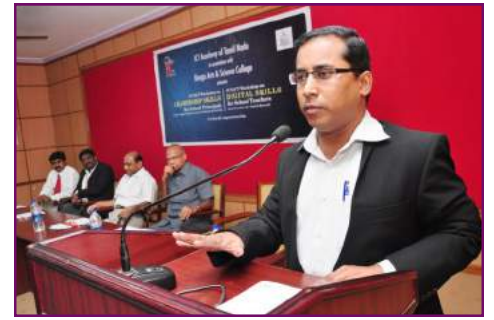
A Workshop on "Leadership Skills" for School Principals on 27.11.2013