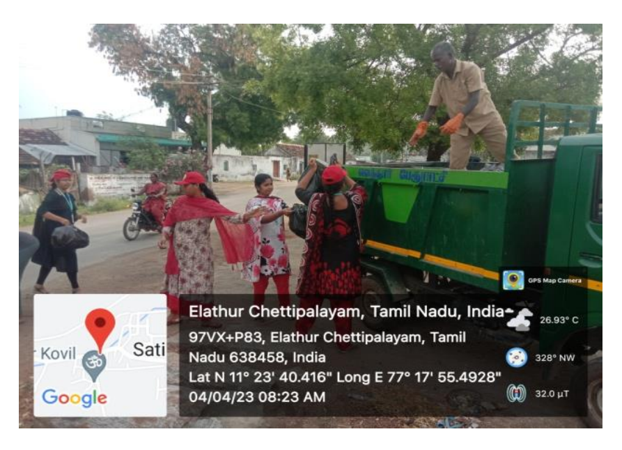
Students giving awareness about Solid Waste Management