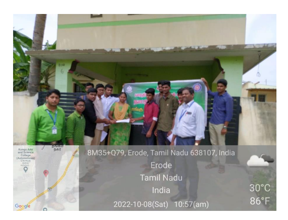
Rain Water Harvesting -Distribute the Pamphlets to Public