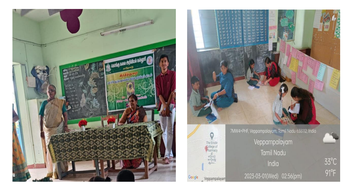
BEEJ- Hindi Literacy Programme