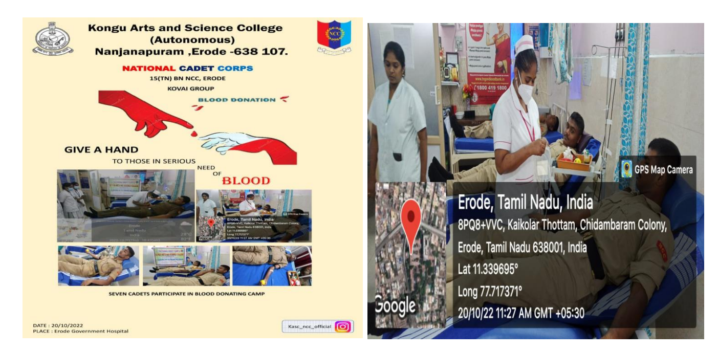
Associate NCC Officers of our College donate Blood

Blood donation camp was conducted by our National Cadet Corps on 20.10.2022 at Government Hospital, Erode and totally 07 NCC Cadets and 01 Associate NCC Officers of our college were donating the blood.