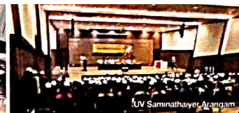
UV Saminathayer Aranam