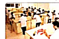
Bio Technology Lab