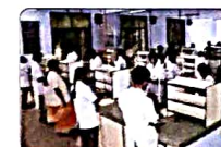
Bio Chemistry Lab