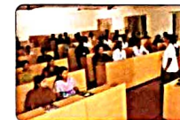
MBA Class Room